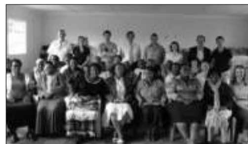
Staff of Sacred Heart meet staff of PCS

Each morning, whilst driving to school we would receive endless smiles and waves from each person we passed. I was overwhelmed by how kind hearted and generous the people of Lusikisiki were. What I found so hard to grasp was the hardship in some of the towns we drove through but nevertheless the high spirits of the people that filled them was inspiring.