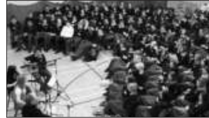
Last Day Celebrations

As Year Head to the Leaving Cert class I can honestly say I have many fond memories of the classroom and beyond. The class of 2009 left their mark on PCS with their wonderful participation in drama, art, musicals and sport. In particular the musicals, Joseph and the Wizard of Oz, were greatly supported by the class of 2009. In soccer, golf, basketball, volleyball and Gaelic games, great honours were achieved. The trips to the cinema and theatre, the Christmas carol service, the drama and our day in Carlingford were all memorable occasions..... I especially recall Sixth Years final day in school in late May when staff, students and members of our community celebrated in the PE hall with an emotional trip down memory lane.