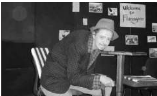
Every village has one!