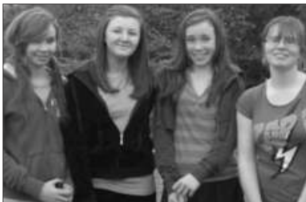
Fun at training