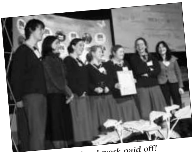
All our hard work paid off!