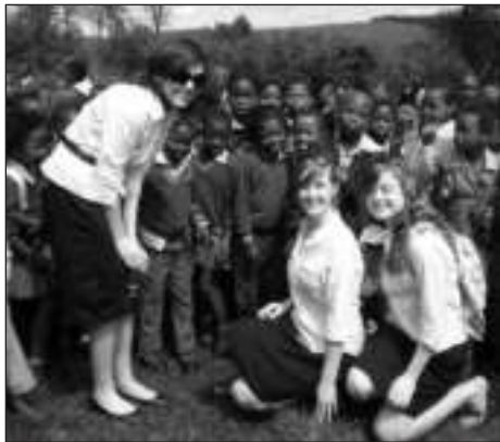
Pupils of Sacred Heart meet pupils of PCS

From the moment we drove into Sacred Heart School and were greeted by so many children wanting so eagerly to say hello and know our names, was the moment that I knew this was going to be the best two weeks of my life.