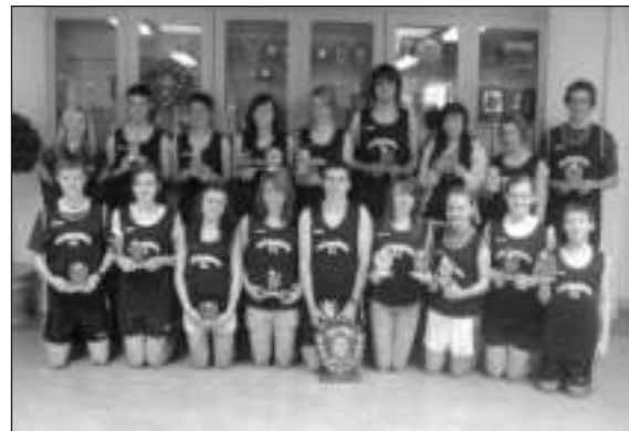
Our athletes after their massive Silverware haul in Santry