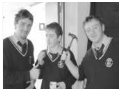
Can we fix it? – Yes we can!