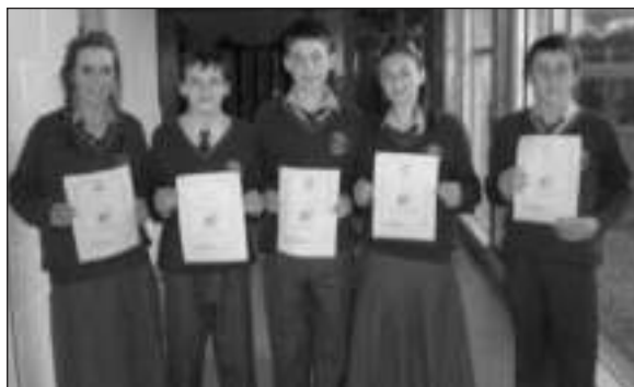
Spikeballers with their Certificates