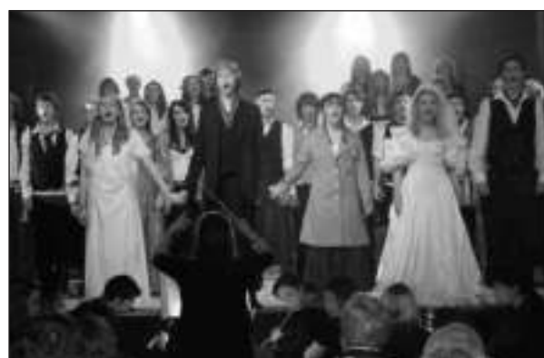
In full voice