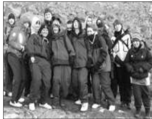
Braving the Elements