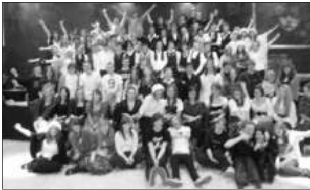
Full cast & crew