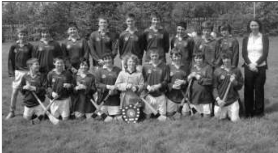
Our victorious Under-14 Hurlers