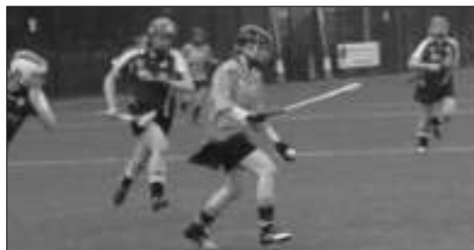
In the thick of it!