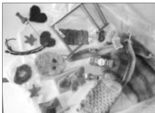
Just a selection of what we made . . .

In recent years, links have been established between Art and Chemistry in Transition Year. Experimenting with natural dyes and mordants has long been part of the Chemistry course – with sources ranging from berries gathered from hedges and trees in Autumn to seaweed, bracken and spices. Two years ago the Chemistry class dyed spun wool that was then woven in Art class, some on looms made in the school, or knitted and then felted. Teachers from both departments have together taken courses to learn how to weave and how to make felt and now the work has been extended so that one of the raw materials used by students is the fleece of a sheep. Those involved are looking forward to an even more productive year next year.