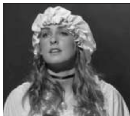
One true lovely lady