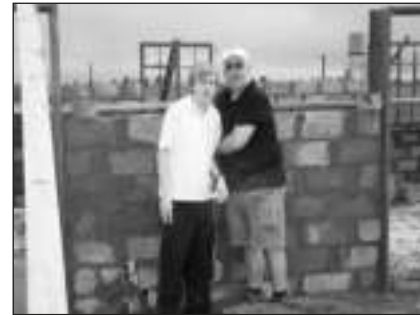
It's a family affair!

There was a system set up each night where every one of us could choose which area we would like to work in the following day. This included jobs such as, Medical, Construction, Art, Science, Music etc. The structure we had in place worked well as everyone got to try out a variety of different areas. Most of the time, I worked with anything relating to art. There were a few classrooms that we transformed from dull, bleak rooms to cheerful learning environments filled with mesmerising colours and vivid images. The children and teachers were in a state of awe at the bright pictures strewn across their normally bare classroom walls.