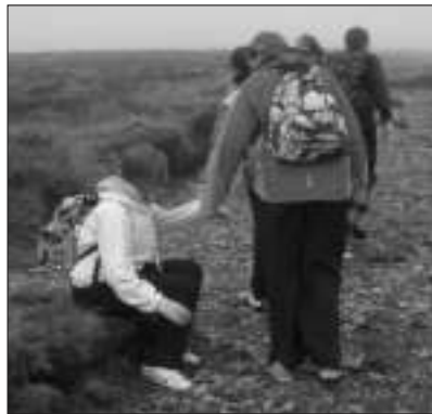
A helping hand