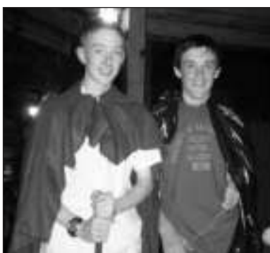
Fun & Games

Moving onto our journey to Cape Town, unlike last year's group, who went to Cape Town at the beginning of the trip, we left it until last. It was an extreme culture shock after flying from Durban into Cape Town. Just outside the town there were fields filled with shacks for houses. It was unreal to think that shanty towns could exist straight outside such a modern, wealthy City. We got a boat out to Robben Island where the great Nelson Mandela served a gruelling twenty seven year term of imprisonment due to his membership of the ANC (African National Congress) a rival banned political party where the Africans sought to abolish the apartheid. We also got to visit the wonderful, Table Top Mountain and its fascinating views.