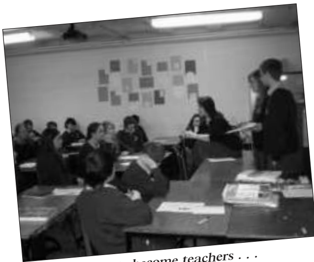
Students become teachers . . .