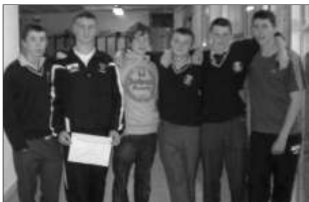
Members of the U-16 Team