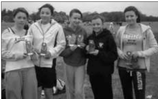
Here come the girls . . . Another successful day in the Phoenix Park