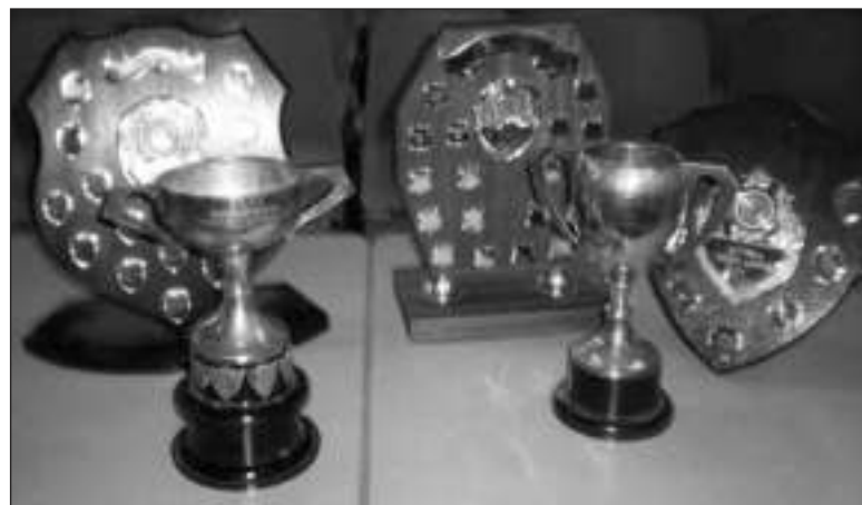
Just some of the silverware won by our athletes this year

Tá na triocha bliain seo romhainn níos dúshlánaí agus níos cinniúnaí fós ná an t-am atá imithe tharainn. Tá sé dhualgas ar an gcóras oideachais tré chéile na hacmhainní a chur ar fail le go dtiocfadh na micléinn in inmhe ar chúirt agus ar phairc na himeartha chomh paiteanta leis an seomra ranga. Ná ligimis i ndearmad íobairtí na n-oidí a treorú an aosa léinn i ngaiscí agus i gcleasa luatha an spóirt. Ta gaiscí spóirt na scoile seo dhá síorimirt in aigní ár n-iarscoláirí ar fud chríocha an domhain go dólum. Ná ceiltar a ndeis orthu siúd a bhfuil rása na scoile le rith fós acu san am atá romhainn le go bhfuairídh samhlaíocht agus méid a ngaisce a gcéadfaí ar uair sháraithe na cinniúna.