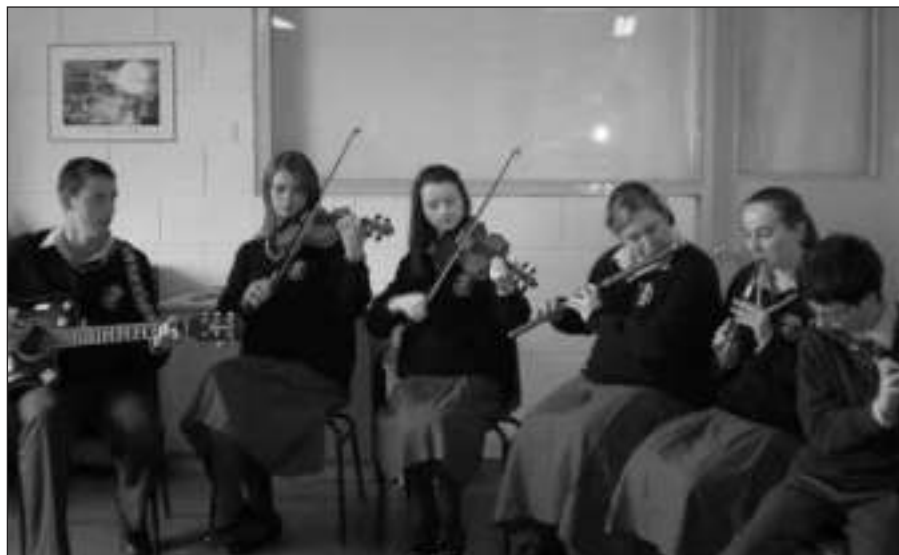
Sound of Music in B3