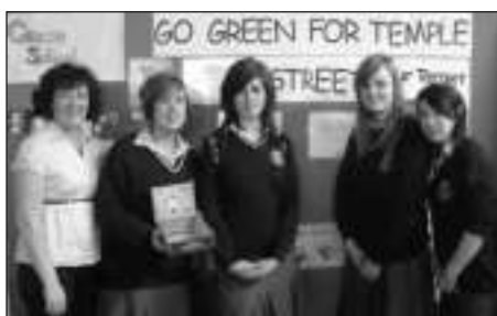
One of the many successful campaigns ran by the Library this year

Requests this year from students led to the setting up of a student book club. The first book chosen, to be reviewed by the students, was Twilight by Stephanie Meyers.