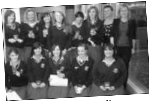
Smiles all round!