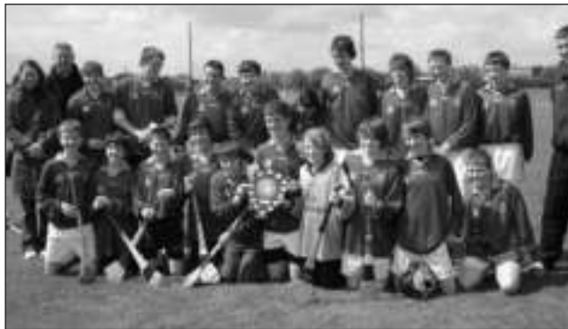
U-14 Dublin Champions