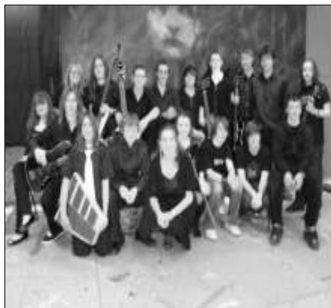
Our fantastic Orchestra