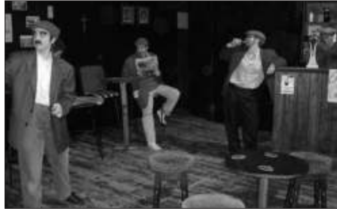
A few of the regulars