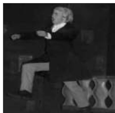
While Conor leaves us from it