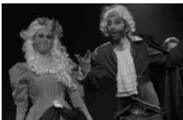
Mr. & Mrs. Thernardier