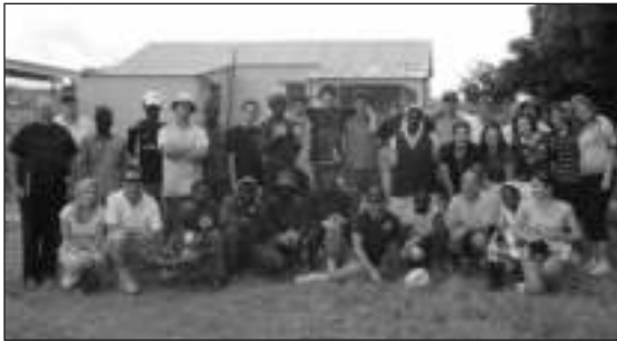
First South African Project

I know that a long and lasting relationship has been forged with the people of The Eastern Cape and that the class of 2009 will support these people again in their professional and skilled careers.